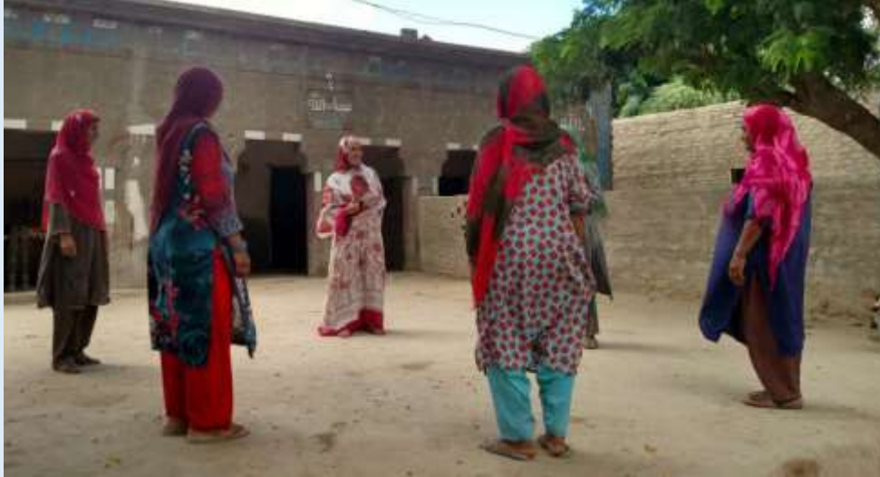
COVID-19 Awareness sessions at District Mirpurkhas