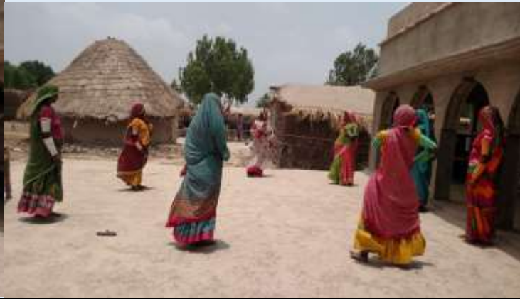
COVID-19 Awareness Sessions at District Mirpurkhas