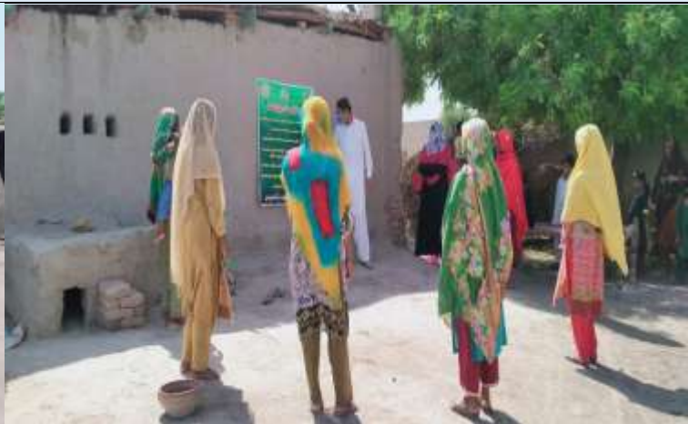
COVID-19 Awareness Sessions at District Khairpur